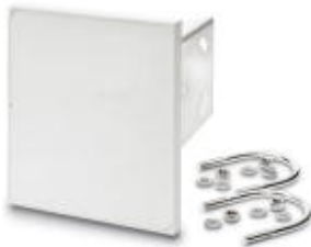
Flat panel antenna, 5 GHz, gain 18 dBi, connection N (female), IP55

Please be informed that the data shown in this PDF Document is generated from our Online Catalog. Please find the complete data in the user's documentation. Our General Terms of Use for Downloads are valid ( http://download.phoenixcontact.com )