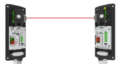
Alignment by blinking LED