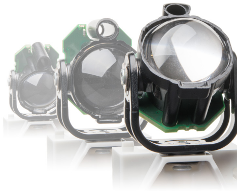
Easy mechanical Vertical adjustment