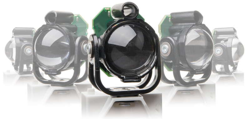
Easy mechanical Horizontal adjustment