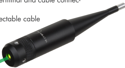
External green laser accessory alignment tool