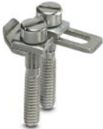
Switching jumper, pitch: 8.2 mm, number of positions: 2, color: silver

Please be informed that the data shown in this PDF Document is generated from our Online Catalog. Please find the complete data in the user's documentation. Our General Terms of Use for Downloads are valid ( http://phoenixcontact.com/download )