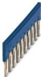
Plug-in bridge, pitch: 8.2 mm, width: 80.3 mm, number of positions: 10, color: blue

Please be informed that the data shown in this PDF Document is generated from our Online Catalog. Please find the complete data in the user's documentation. Our General Terms of Use for Downloads are valid ( http://phoenixcontact.com/download )