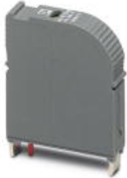
Type 2 arrester replacement plug (surge arrester) with high-capacity varistor with low leakage current.

Please be informed that the data shown in this PDF Document is generated from our Online Catalog. Please find the complete data in the user's documentation. Our General Terms of Use for Downloads are valid ( http://download.phoenixcontact.com )