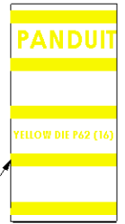
Color coded barrel markings