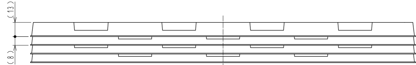
Fig.4 Stacked tray drawing (1:2)