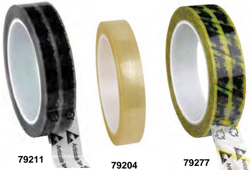
Tape is wound on a low-sloughing plastic core.